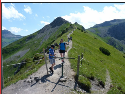
Hiking in Lichtenstein