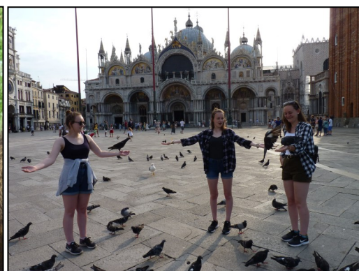
Feeding pigeons in Venice